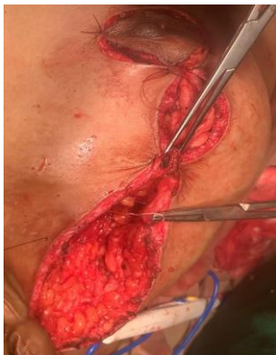
Image F: Elevation of the breast by posterior placcation and fixation to the muscle