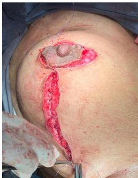
Image G: Subcuticular suture