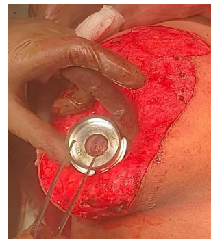
Image D: Using a circular metal instrument, a "cookie cutter" to maintain the proper size of the areola